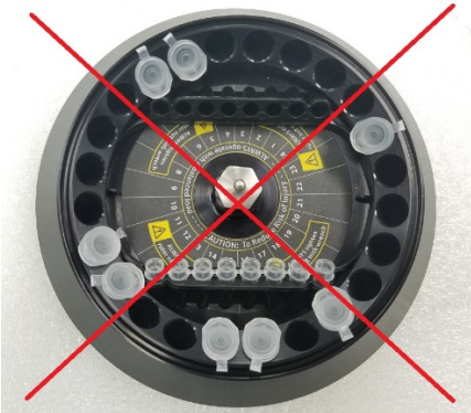
Figure 1. Loading the rotor to achieve balance