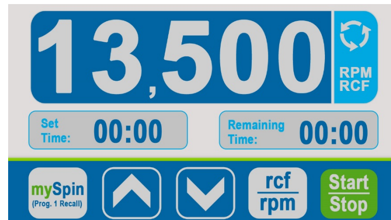
Figure 2. MC-24 Touch™ control panel layout

The centrifuge may be operated for a short run by pressing and holding the "start/stop" button. The centrifuge will continue to run as long as the button is held down.